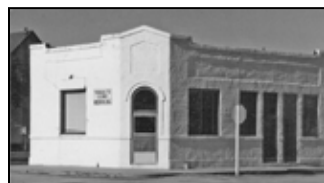
TCM bought this bank building in Cope, Colorado, in 1962 for $600 to serve as our first office.

How about being a Home? Right on. TCM is home to missionaries in Africa,